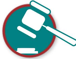
Threats Of Lawsuit