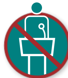
Denial of Space