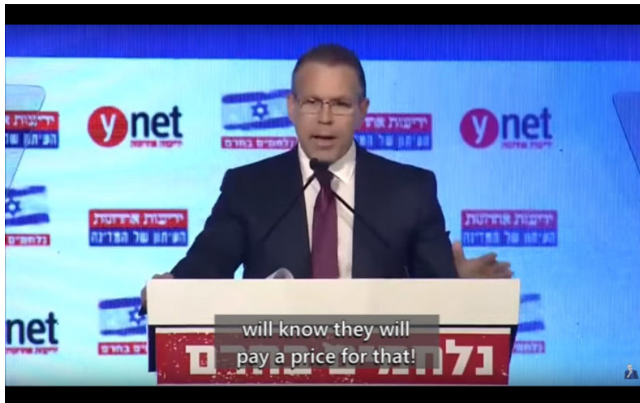
Israeli Minister of Strategic Affairs, Gilad Erdan, at the 'Stop The Boycott' Conference, Jerusalem, 28th March 2016.

IHRA-WDA for publishing on a FNV website an article about a study of Israeli apartheid by the UN agency ESCWA and calling for a boycott of Israel as the morally appropriate response to its apartheid regime.