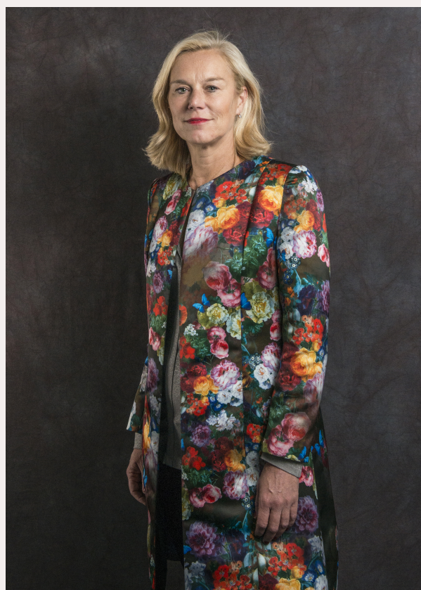
Former Dutch Minister of Foreign Affairs, Sigrid Kaag.

The smear campaign became increasingly personal when Geert Wilders, leader of the populist far right Party for Freedom (PVV), tweeted a photo that showed Kaag, her husband and four children posing – in his words – “with PLO-terrorist Yasser Arafat”.