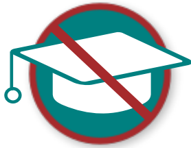
Restricting Academic Freedom